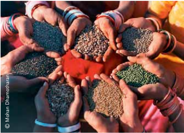
Genetic engineering has accelerated the industrialization of agriculture and may lead to a contamination of genetic resources by transgenes. The picture shows a variety of local vegetable seeds presented by a group of smallholders in India.

as the unfashionable older cousin of genetic engineering" (Knight 2003). Today, the concentration in the seed sector can be considered the most serious factor responsible for the reduced genetic diversity of agricultural crops.